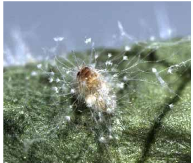
Above Picture: Western Flower Thrip infected and killed by NoFly WP

*Venom®, Daitol®, Knack®, Malathion®, Hero® and Courier® mix and rotation