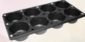
Muffin Tray with 4" cells 10.9" x 21.4" x 3"