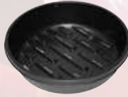
Plant Pie 11 11" x 3"